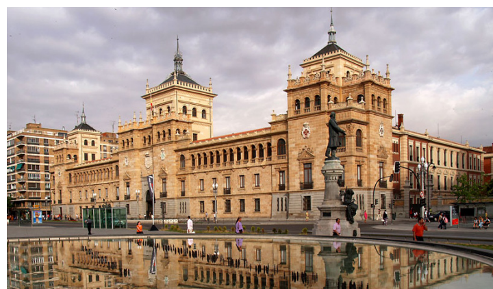
Picture 3 / URBAN GreenUP Frontrunner City of Valladolid