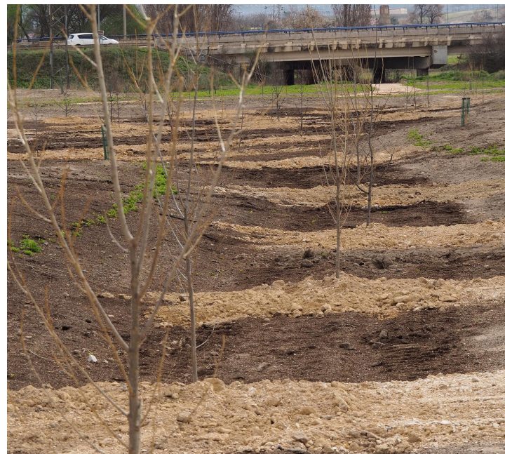
Picture 1 / Plant carbon sink, Valladolid