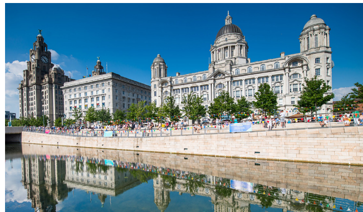
Picture 2 / URBAN GreenUP Frontrunner City of Liverpool