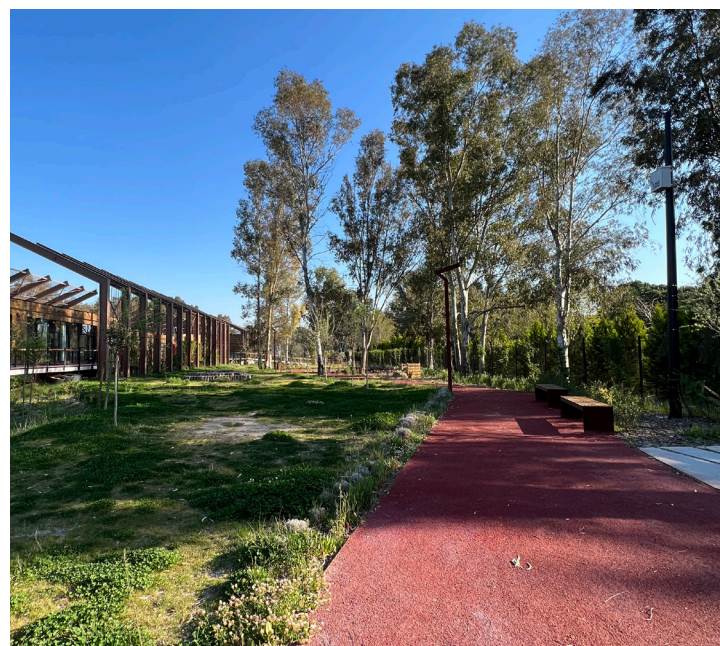
Picture 2 / Landscaping roads with permeable surfaces, Izmir