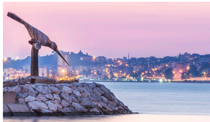
Picture 1 / URBAN GreenUP Frontrunner City of Izmir