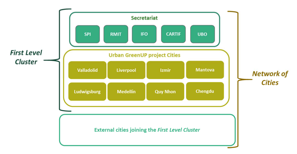
Figure 1. URBAN GreenUP Cluster and Network of Cities structure and members

According to the DoA and as represented in Figure 1, the Secretariat and the URBAN GreenUP project Cities will form the First Level Cluster . The wider Network of Cities , for its part, will be composed of the members of the First Level Cluster along with an additional number of at least 15 External cities with a high replication potential joining the initial group.