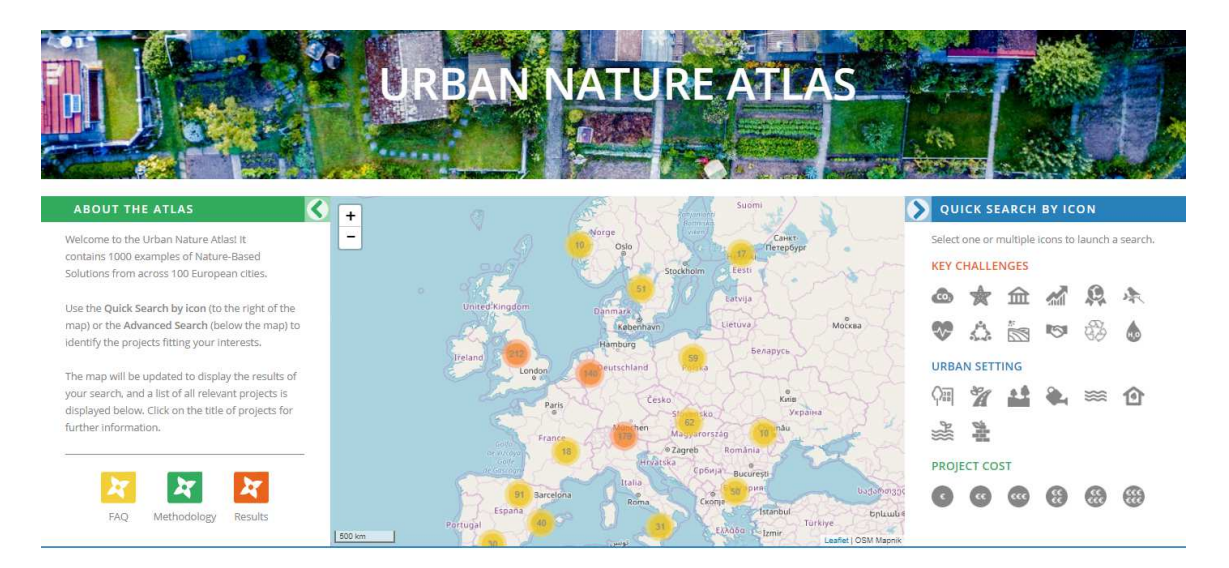
Figure 3. Layout of the Naturvation's Nature Urban Atlas