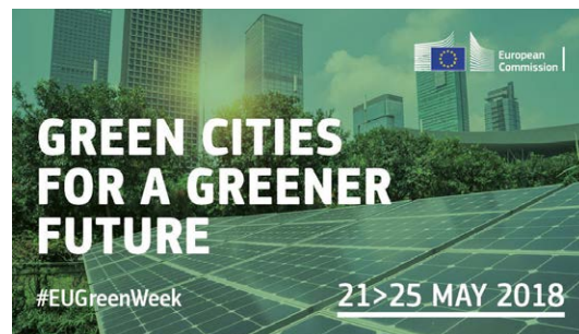
Green Cities for a Greener Future Brussels, 21-25 May 2018