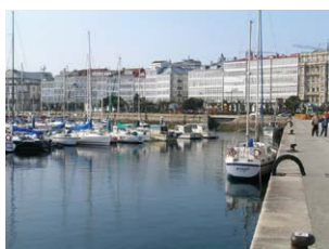
ThinkNature Brainstorming Forum and the Symposium on Indicators for Transformative City Innovation with NBS A Coruña, 16-18 May 2018