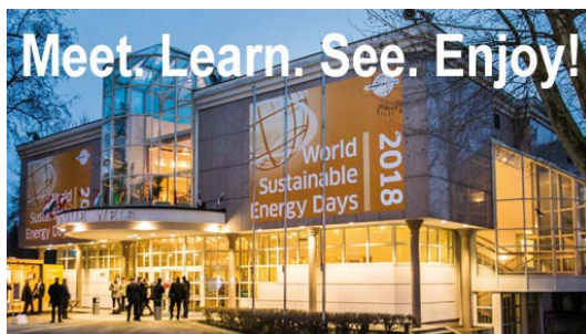
World Sustainable Energy Days Wels, 28 February-2 March 2018