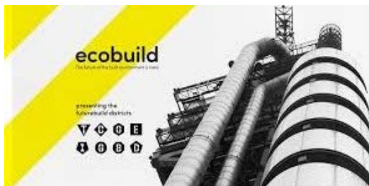
ecouild London, 6-8 March 2018